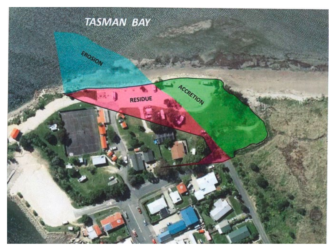
Above and on previous page: draft survey plan ML566985 and satellite view. The area marked 'erosion' shows land that was part of the original Crown Grant but has since eroded. The land marked 'accretion' shows the newly formed land. The 'residue' section is land that has always been part of the Crown Grant, but has been occupied by the Council.

Back in court the following day in Nelson, Judge Reeves explained the final orders she would make. Under s 131, she made an order determining that the residue of the original block is Māori Freehold Land. Secondly, she made an order determining the ownership of that land, in accordance with the s 40 report prepared and which had been reviewed and amended by descendants. The third order determines that the additional area of land is in fact an accretion and is to be added to the other area and then comprise one block of land of 0.9241 hectares.